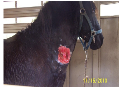
After two weeks of treatment

south gate open; a stallion with a life threatening wound as a result of a stallion fight. This is only a partial list!