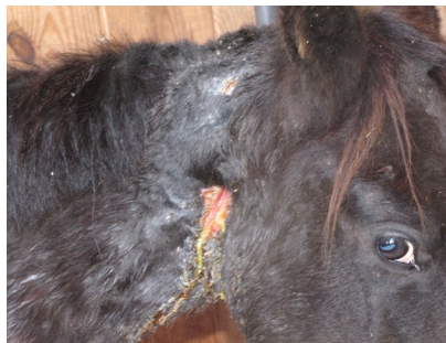
Rainbow shortly after capture in Oct.

the chest with an arrow. An infection from that wound traveled to her lymph nodes and was only a quarter inch from her jugular vein. Death would have been certain without treatment.