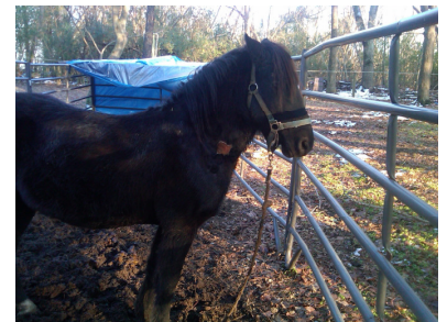
Six weeks after injury

Fortunately, our success stories far exceed our disappointments. Still, each life that we cannot save takes a piece of our hearts. We try to remain focused on the lives that have been saved as a result of our efforts and those of our volunteers. We are grateful to our members and supporters who so generously contribute to our mission to preserve and protect the wild horses.